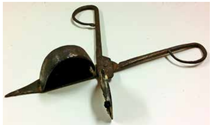
Colonial-era candle snuffer from the Lathrop Collection. Many items in the collection came from the Lathrop family who were early settlers in the southern end of Manchester, adjacent to what is now the Wilcox farm.