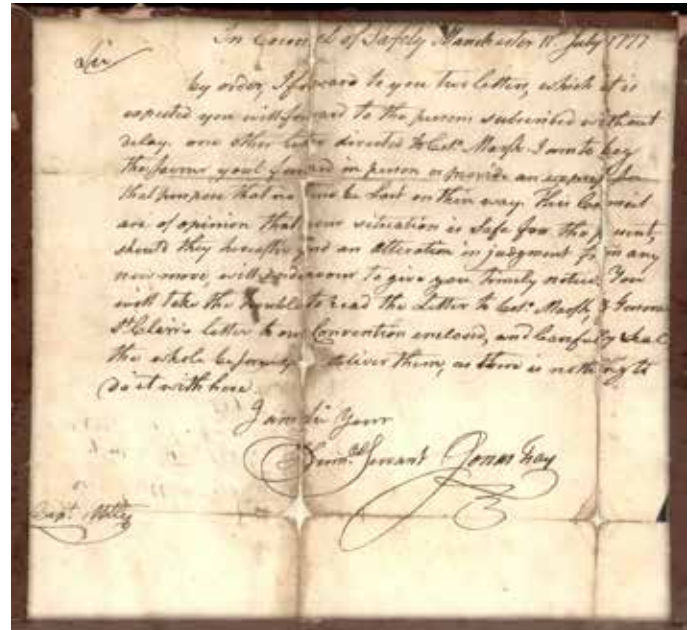
Council of Safety document, 1777