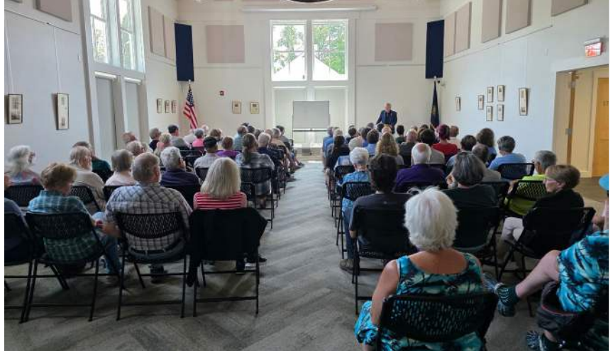
The Howard Coffin presentation at MCL.